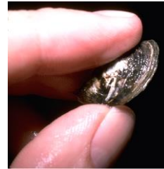
Adult Zebra Mussel

These freshwater mollusks are too small to be seen with the naked eye as juveniles. Becoming more visible as they mature, they develop the ability to attach to surfaces.